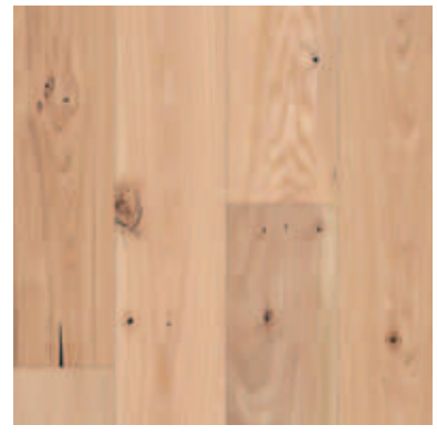
GRADE CD (rustic): Natural colour variations and sapwood allowed, knots up to 40 mm allowed, cracks filled with black or natural colour filler are limited in numbers.