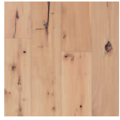
GRADE DE (extra rustic): All natural mistakes in wood allowed, unlimited numbers of cracks and knots filled (open or closed) with black or natural colour filler.