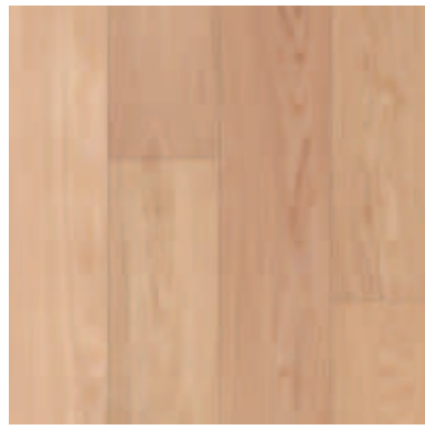
GRADE AB (natural): Unique structure and colour, mistakes like small knots limited or not present, no cracks.